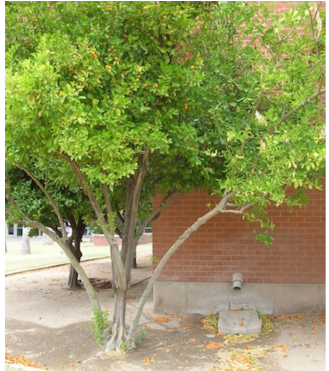
Citrus tree planted on the southeast corner of a building where it is shaded from hot summer sun

Sudden storms in spring and summer can cause branches to break and flowers and fruit to fall. Heavy winter snows and ice storms can also cause structural damage to the trees. While these cannot be avoided, the damage can be lessened by keeping the trees pruned and the orchard clean.