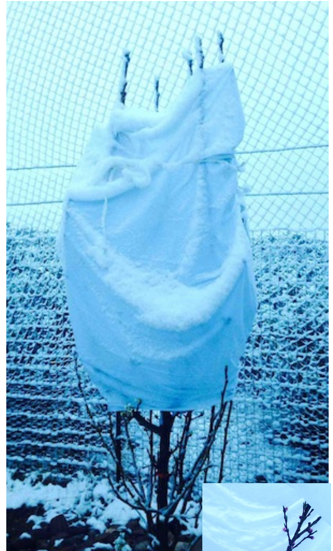
A sheet protects a blooming pear tree from a late season snowfall. The orchard is also surrounded by a deer fence and covered with bird netting to protect fruit.

A more permanent option is to build structures or cages over small trees and drape them with tarps, blankets or shade cloth to protect them from frost (as well as sun) when needed. If possible, place lamps or heaters within tree canopies or under trees to emit warmth overnight. Moisten soil before predicted cold nights, since damp soil retains heat better than dry soil.