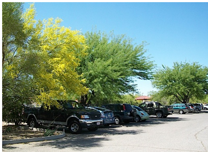
Shade is cast on cars by native trees in a parking lot.