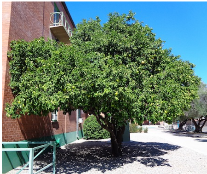
A citrus tree on the east side of a brick building benefits from morning heat and light all year, while being shaded from hot afternoon sun in summer.

In those Arizona climates where winter warmth is welcome, planting trees that drop their leaves—rather than planting evergreen trees—on the south side of buildings will allow sun to enter south-facing windows.