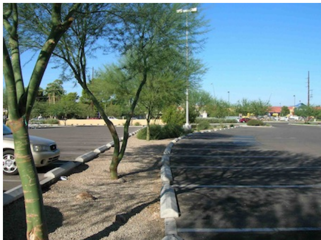
Deep shade is cast to the north in winter by native trees. The water harvesting basin receives runoff water from the adjacent parking lot.